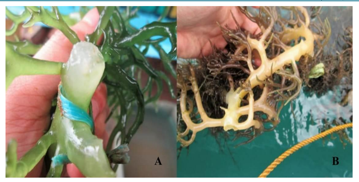
Fig. 2: Actual image of the representative of K. alvarezii green (A) and K. alvarezii brown (B), showing the thalli conditions as observed in the seaweed farms in Mampang and Lapuyan, Zamboanga Peninsula, Mindanao, Philippines with wide-scale whitening of ice-ice

Table 2: Mean % incidence of ice-ice disease in K. alvarezii green and K. alvarezii brown between the two selectedfarms in Zamboanga Peninsula, Mindanao, Philippines